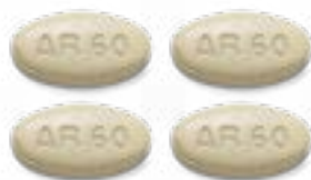
Tablets shown are actual size.

ERLEADA ® is indicated for the treatment of metastatic castration-sensitive prostate cancer (mCSPC) or for the treatment of non-metastatic castration-resistant prostate cancer (nmCRPC).